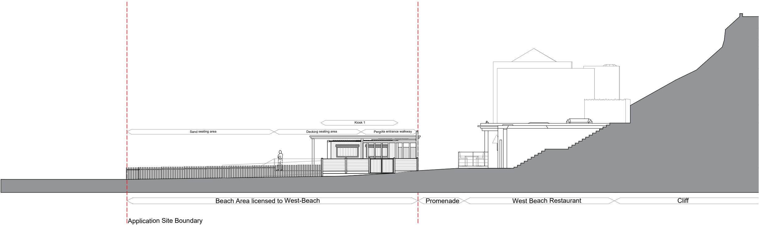
Proposed East Elevation 1:200 @ A3